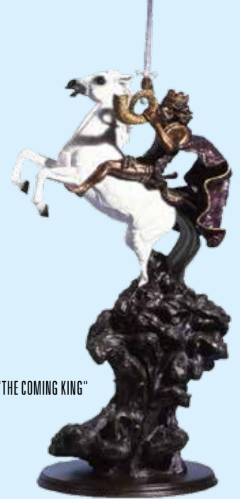
"THE COMING KING"

A dramatic sculpture by Max Greiner, a friend of this ministry, depicting our soon-coming King who will reign supremely as "Lord of Lords."